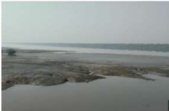
Navi Mumbai, Maharashtra, India

4XXM+XHM, Airoli, Navi Mumbai, Maharashtra Lat 19.150078° Long 72.984994° 27/11/21 11:00 AM