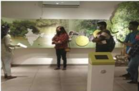
Navi Mumbai, Maharashtra, India

4XXM+XHM, Airoli, Navi Mumbai, Maharashtra Lat 19.150078° Long 72.984994° 27/11/21 11:00 AM