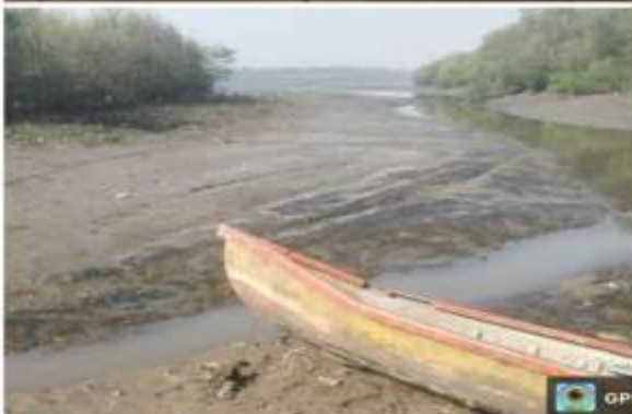
Navi Mumbai, Maharashtra, India

Unnamed Road, Airoli, Navi Mumbai, Maharashtra India Lat 19.147328° Long 72.982008° 27/11/21 10:33 AM