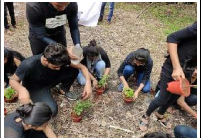
Tree Plantation done by volunteers at Vikhroli Post Office