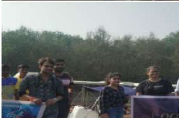
Navi Mumbai, Maharashtra, India

4XXM+9CV, Airoli, Navi Mumbai, Maharashtra 4007 Lat 19.148519° Long 72.983456° 27/11/21 10:02 AM