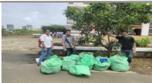
Volunteers cleaned the premises at University of Mumbai, Kalina